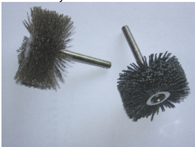
Abrasive Nylon Brush