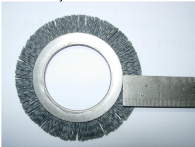
Abrasive Nylon Brush

We can produce solid and sturdy quality abrasive nylon brush with various kinds of steel wire material and customer's different brush size and specification requirement to reach customer demand.