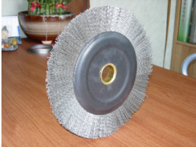
Abrasive Nylon Brush

In every industry, need to use abrasive nylon brush to grind, polish for improve the quality of product.