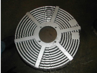
Wire Processing Brush

In every heavy industry, it needs to use brush accessories to do various kinds of grinding, polishing, and rust elimination, except for corrosion, to improve production efficiency.