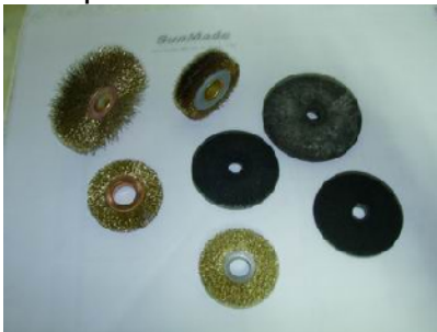
Single Rubber Encapsulated Wheel Brush

We can produce solid and sturdy quality rubber encapsulated brush with various kinds of steel wire material and customer's different brush size and specification requirement to reach customer demand.