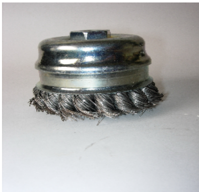
Power Twist Knot Brush