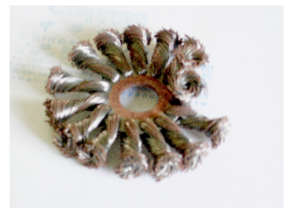
DIY Rose-Shape Twist Knot Brush