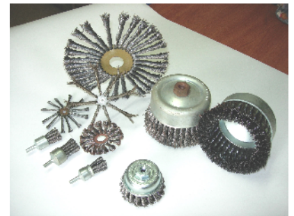
Rose-Shape Twist Knot Brush